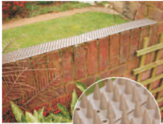
Walls Prikka-Strip can be fitted side-by-side to increase the effect.