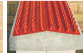
Double-up for wider applications.